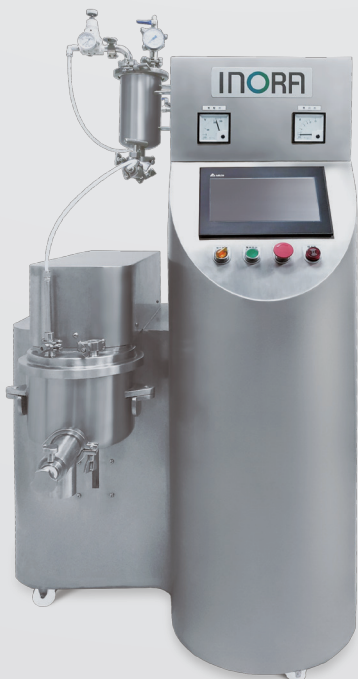
實驗型 Laboratory Size