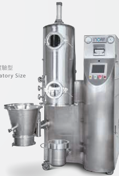
實驗型 Laboratory Size