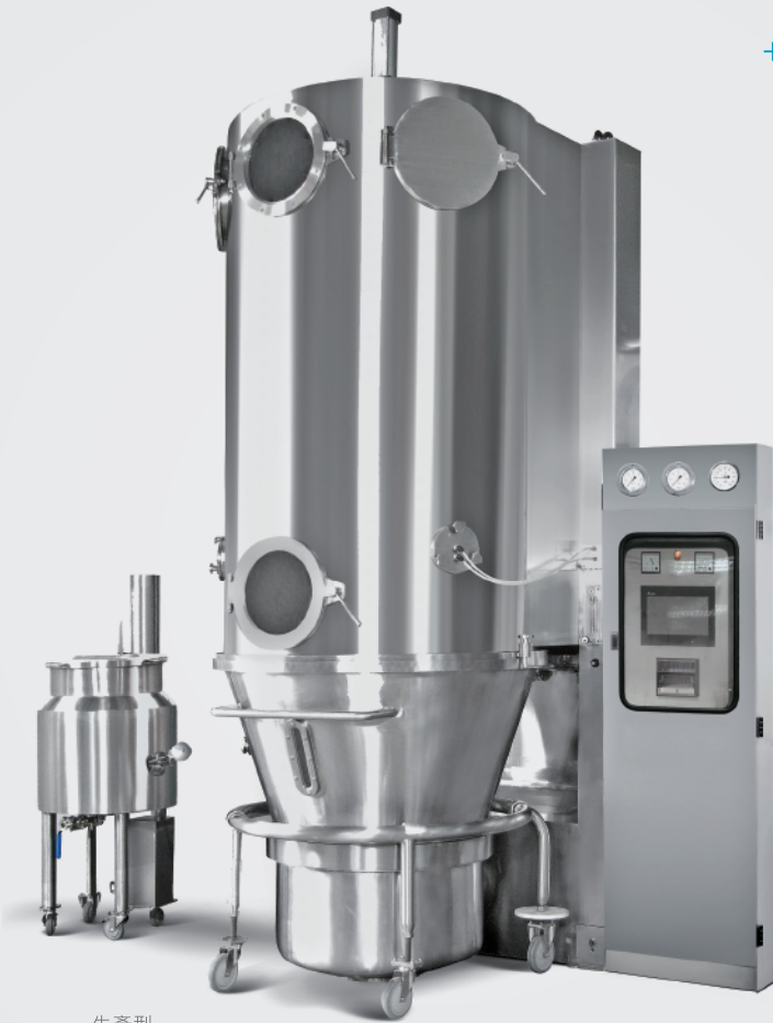
生產型 Production Size