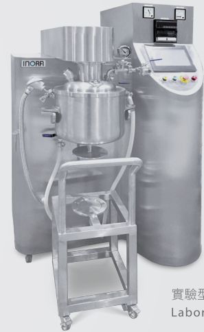
實驗型 Laboratory Size